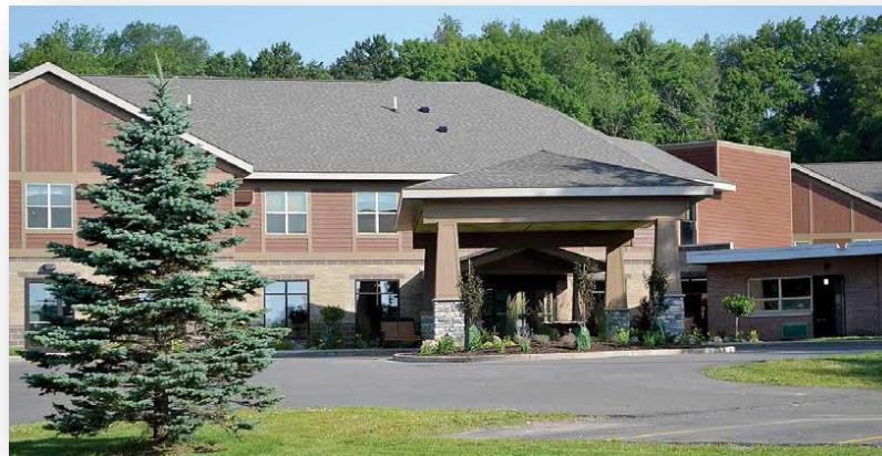
New Glenhaven Facility →

Keep Calm & Lay in the Sun.....with sun block on of course!