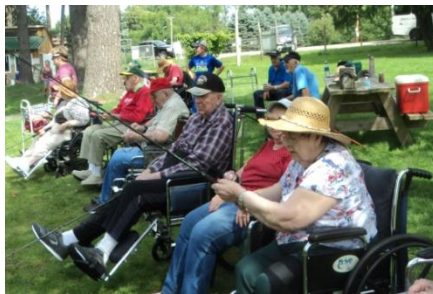
Fishing in Star Prairie

"Autumn is a second Spring, when every leaf is a flower." ~Albert Camus