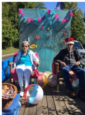
The Valentine's Day Royalty from Glenhaven in the Rustic Lore parade.