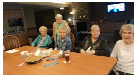
Residents with their BLUE ribbons from the fair

Like 'Glenhaven, Inc.' on Facebook to stay updated on the project!